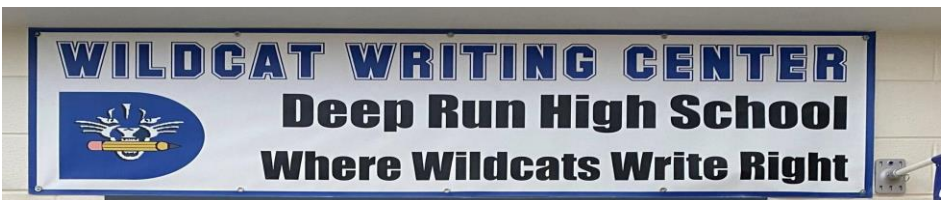
Figure 2. The Writing Center banner that hangs above the door into the classroom that houses our Writing Center.