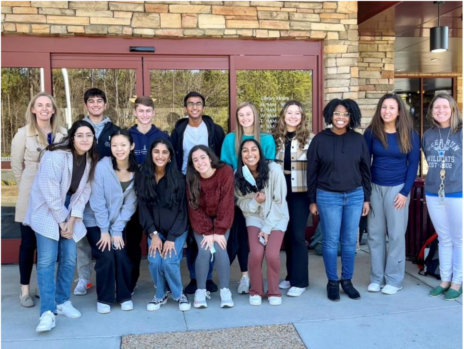
Figure 1. Members of the 2021-2022 Deep Run Writing Center staff and teacher sponsors pausing for a photo while participating in the 2022 SWCA Virtual Conference.

Writing Center possible. We appreciate the work our Writing Center does and anticipate continued meaningful work ahead.