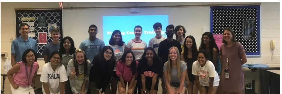
Figure 4. 2022-2023 Writing Center teacher sponsors and staff smiling after completing their summer training session.